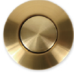
PVD coating on brass surface