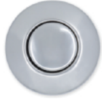
Stainless steel mirror finish